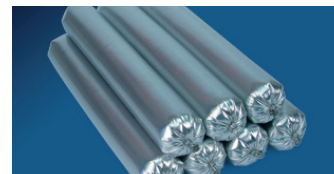
600ml foil packs Part No: AC600WTCE