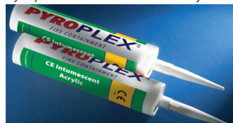
310ml cartridges Part No: AC310WTCE

Pyroplex ® CE Intumescent Acrylic is supplied in: