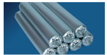
600ml foil packs